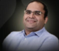
Mr. Rakesh Biyani