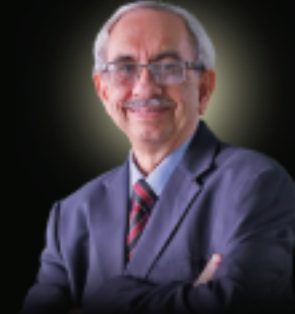
Shri Nadir Godrej Chairman, Godrej Industries

IMA Lifetime Outstanding Achievement Award 2025